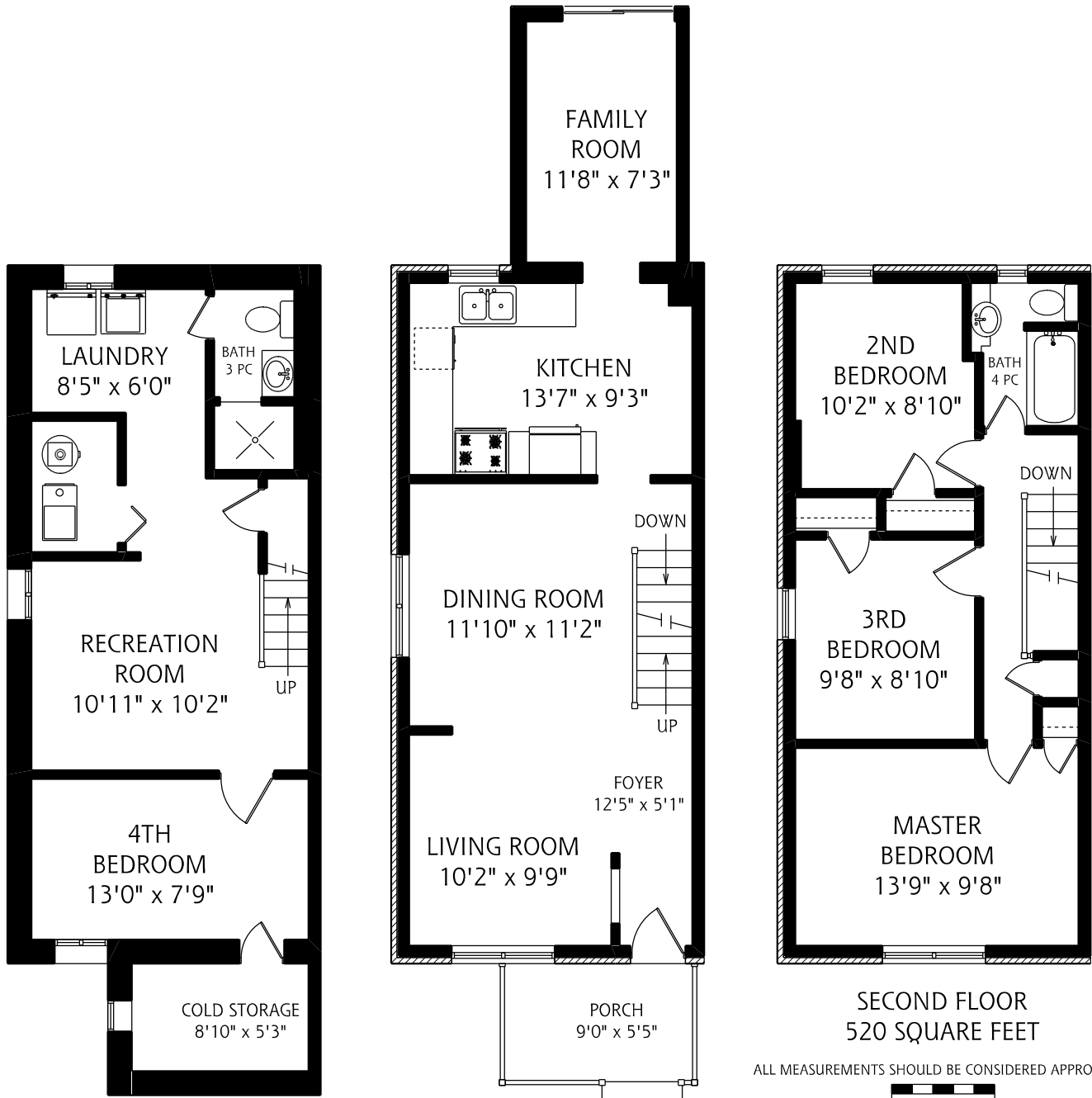
LOWER LEVEL 520 SQUARE FEET